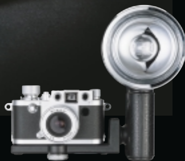
MINOX Classic Camera Leica III f with flash (option)