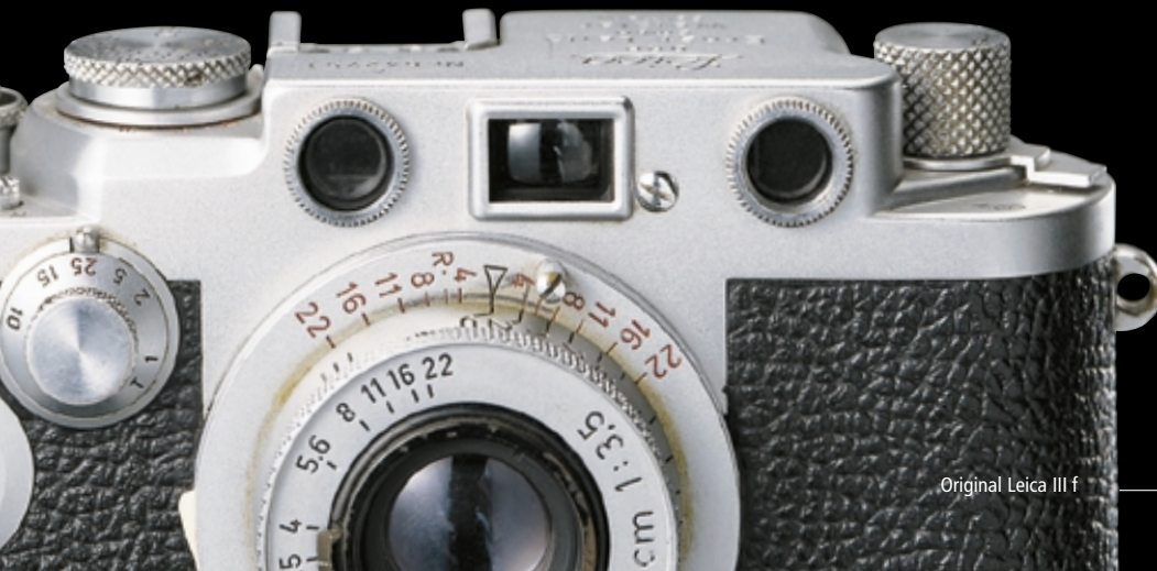
Original Leica III f

In summary: Because a true classic never dies, the legendary Leica III f will be brought back to life in the MINOX format.