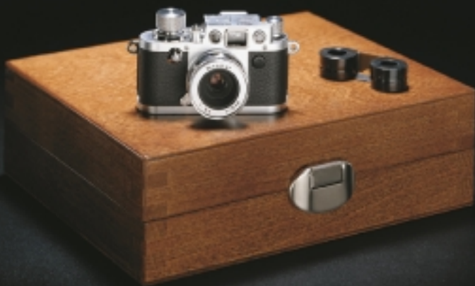
MINOX Classic Camera Leica III f with wooden box